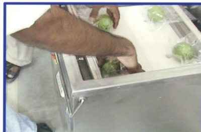
PACKAGING OF GUAVA FRUITS USING VACUUM PACKAGING MACHINE

The farmers, processors and exporters are recommended to adopt packaging technique developed by Junagadh Agricultural University for increasing the shelf life of guava fruit up to 18 days at room temperature by packing in 50 \mu polyethylene bag at a vacuum level of 700 mm Hg.